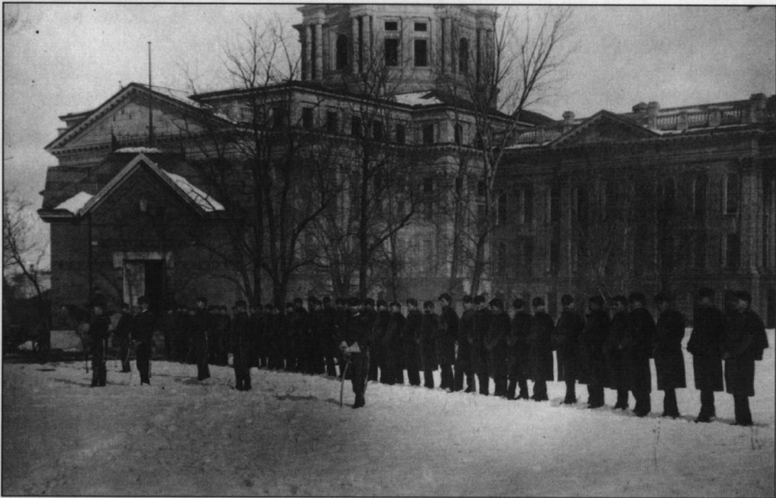
Kansas State Militia, Topeka and Wichita batteries, on the statehouse grounds, February 17, 1893, during the Legislative War.

"LIKE A RIOT," proclaimed a headline in the State Journal on January 10, 1893. The story told of mass confusion, and the Topeka Daily Capital reported the activities of a "howling mob." Newspapers throughout the country called it a "war"; and matters got worse before they got better. No, these journalists were not covering a campus demonstration, labor strike, or race riot. They were broadcasting the proceedings of the Kansas State Legislature—the first skirmishes in the "legislative embroglio" of 1893. Before it ended, armed bands of "deputies" roamed the halls of the capitol and the streets of the capital city, militiamen covered the statehouse grounds, and Kansas "was upon the verge of civil war."