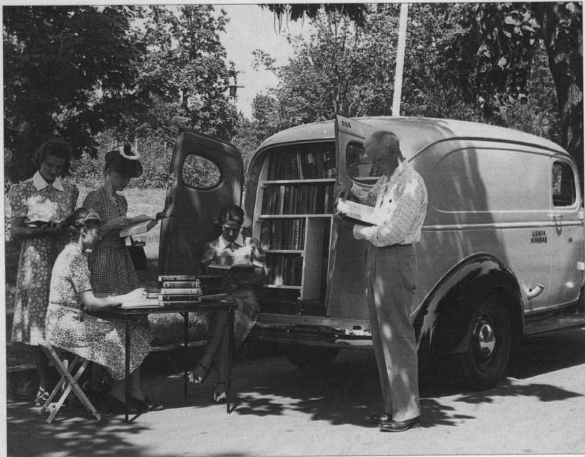
WPA Library Service, Bookmobile, ca. 1940.

Perhaps the best known of the New Deal's numerous "alphabet agencies" was the Work Progress Administration (later the Work Projects Administration). Created in 1935 to provide paying jobs for out-of-work Americans, the WPA left a tangible legacy in the form of public buildings, reservoirs, bridges, art work, historical research projects, and much more. The Kansas WPA's "construction" projects were overseen by its Engineering Division; "non-construction" work came under the supervision of the Professional and Service Division. The latter included the Research and Records, Public Welfare, and Community Service Sections. "Community Service Projects," read a 1940 report, "operate on a state-wide basis and include activities of value or interest to the entire community." Among the eleven separate projects listed were nursery schools, education for physically handicapped persons, and braille.