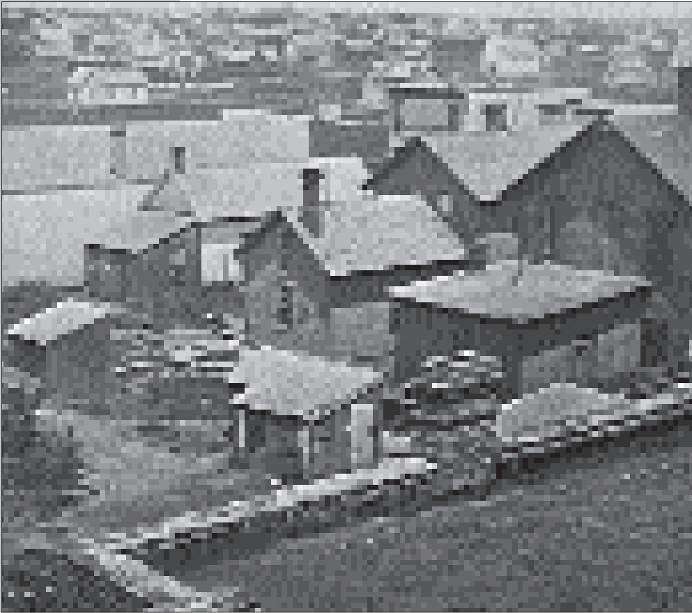
Privies were common parts of the landscape, as seen in this photograph of Abilene. Improper placement of and drainage from these structures frequently resulted in foul air and contamination of public water sources.

We have a population in this city of about twenty eight Hundred a great majority of them are in limited circumstances the most of whom own their own cow or cows and some of the other animals enumerated in the ordinance. . . . We have an area of about thirteen Hundred acres within the city limits but thinly settled with a common and unsettled territory as large if not larger than any city of our population within the state of Kansas, and it is my firm conviction upon mature deliberation that it would [be] an exceeding great hardship upon our citizens in general to enforce said ordinance. 12