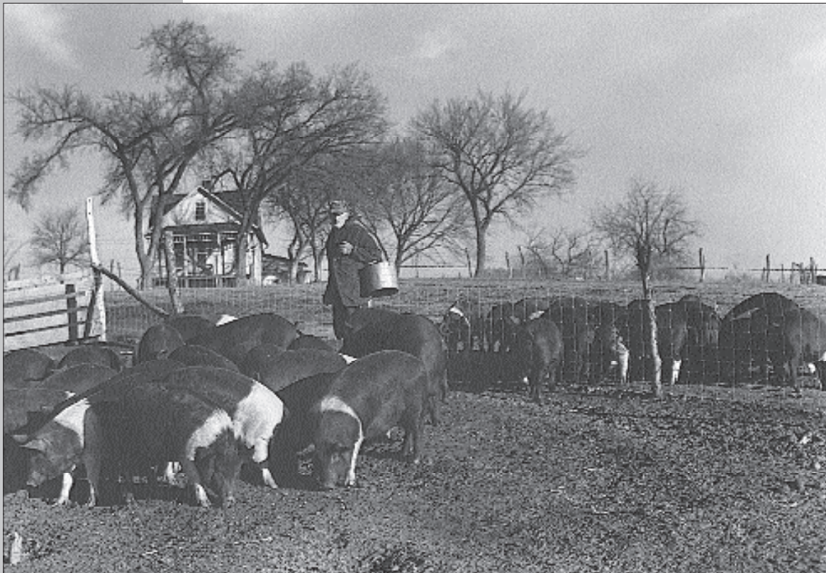
Although cattle and hogs roaming at large presented serious health concerns, laws to fence livestock created much controversy among farmers and stockmen.

stenches that ever offended the nostrils of man, that which comes from the south side of town is the worst," a Clay Center editor fumed. The "dead cattle, horses, hogs and garbage on the other side of the river, . . . the stock yards and Dexter's hog yards near the mill make a combination that is almost strong enough to raise the dead. . . . More disease is attributed to these places than any other cause." But the aroma's origin might well have been private, rather than commercial. "Look out for the 'nuisance' cards," one editor warned his readers. "You will be ashamed when one is plastered on the door of your filthy reeking outhouse." 24