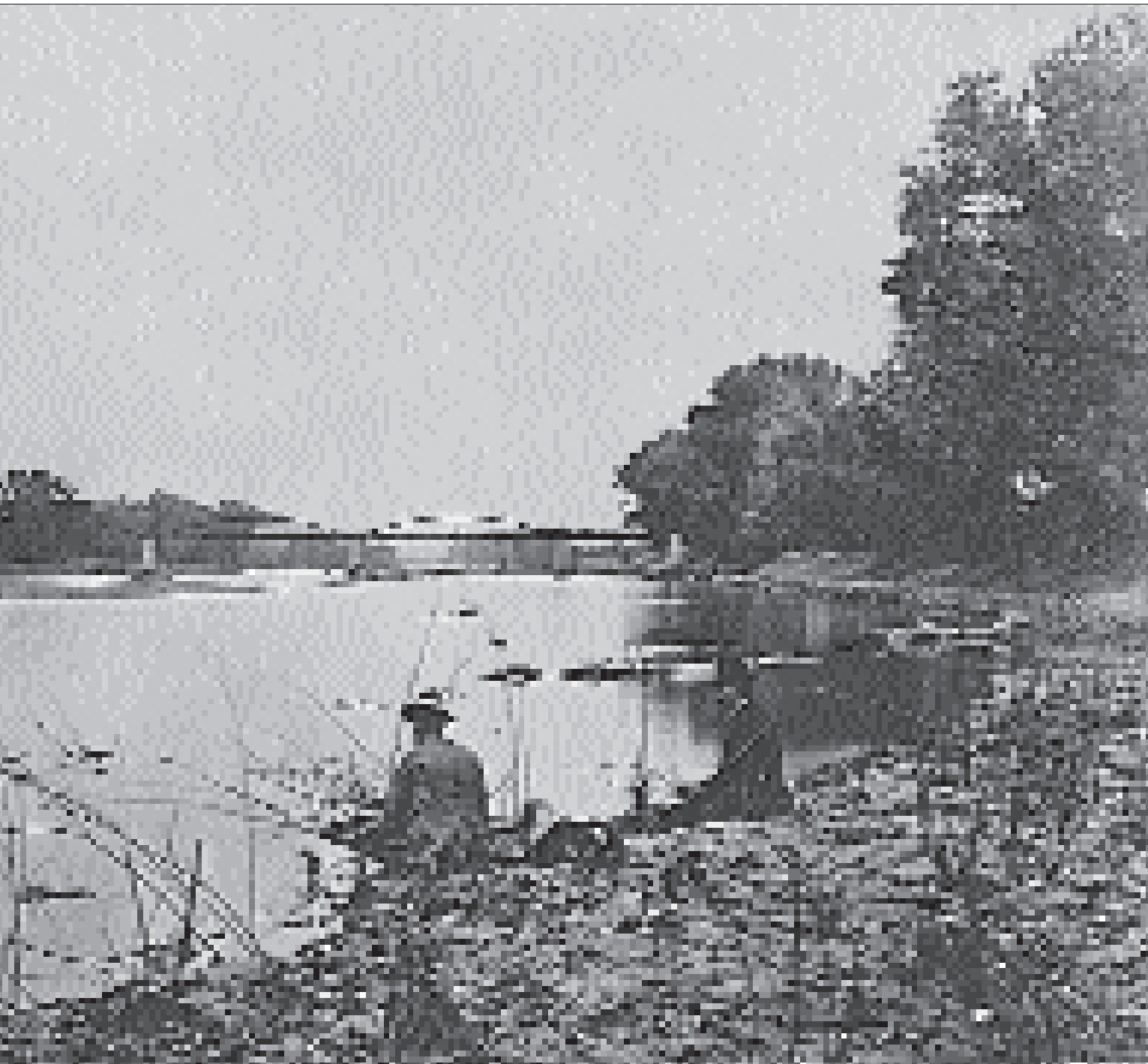
The Kansas River, ca. 1874, was described in 1887 as "one of the nastiest rivers that I know of."

D ead pigs bobbed in the swollen waters of the Republican River. "The hogs and other animals drowned in the late freshet," the editor of the Cloud County Critic wrote in June 1885, "have been left to decay and pollute the water and the air, endangering the health of the communi-