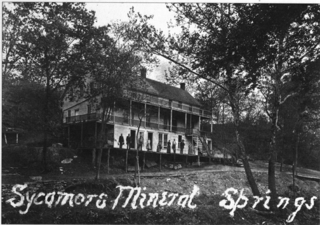
Sycamore Springs, Brown County, ca. 1890