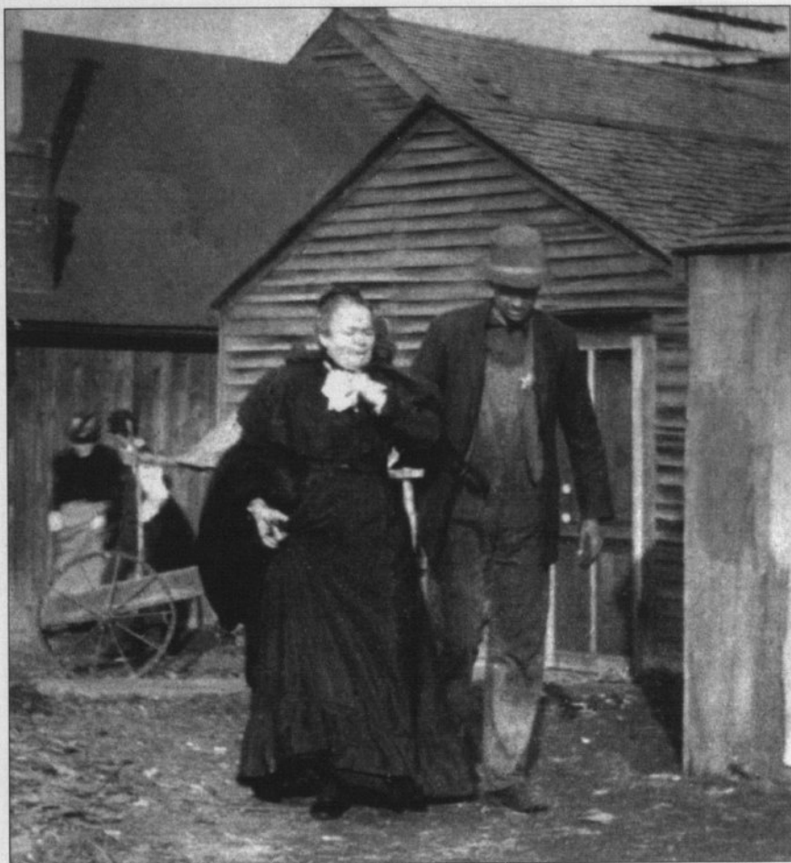
Carrie Nation, Enterprise, Kansas, 1901.

The year 1901 was marked by what certainly must be considered one of the most unusual scenes or occurrences in Kansas history: a matronly woman, dressed in black, wielding a hatchet and exhorting her fellow Kansans to really give up demon rum. Frustrated after five futile years of conventional temperance activity in and around her home town of Medicine Lodge, Carrie Nation, known locally as "Mother" Nation and later as CARRY A. NATION, burst onto the Kansas scene, attracting national attention by launching a crusade against illegal joints. Her saloon smashing campaign reached Topeka in late January 1901. By the summer of that year she had scolded Governor William Stanley, lectured the legislature and delegates attending the annual meeting of the Kansas State Temperance Union, destroyed some barroom fixtures, spent some time in jail, and launched a brand new, albeit short-lived, newspaper, The Smasher's Mail . For the next several years, Mrs. Nation endured ridicule, arrest, and jail to promote the cause to which she was committed.