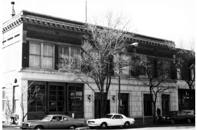
In 1895 William Allen White bought the Gazette with borrowed money. By 1900 the paper was well established enough that White was able to build the two-story structure that still houses the paper today at 517 Merchant Street in Emporia. Pictured here are the paper's offices after their 1967 renovation by W. L. and Kathrine White, with what is likely Call's white Ford Mustang parked out front.