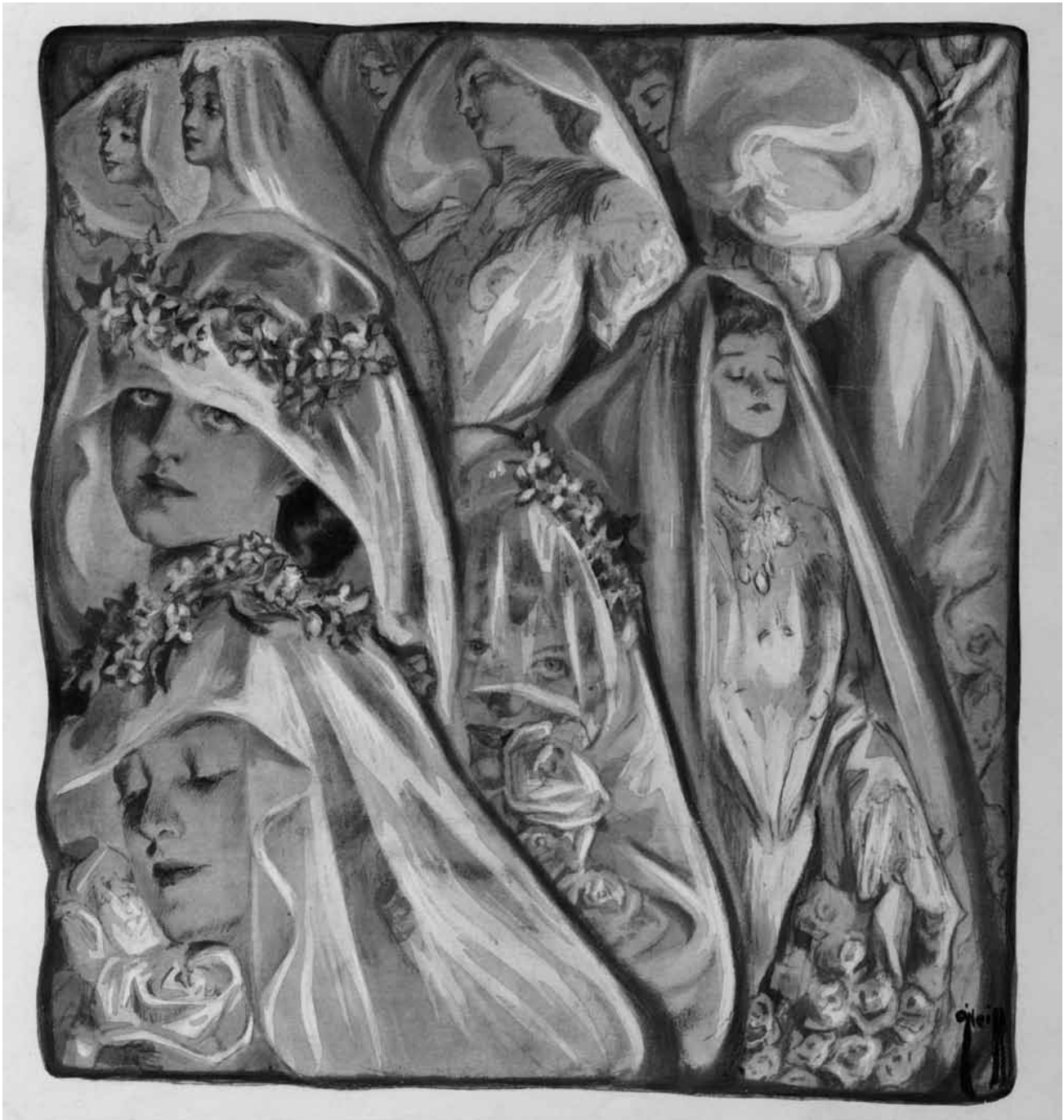
June Flowers, by Rose Cecil O'Neill, from the cover of Puck, May 31, 1905.

Kansas History: A Journal of the Central Plains 34 (Summer 2011): 142-55