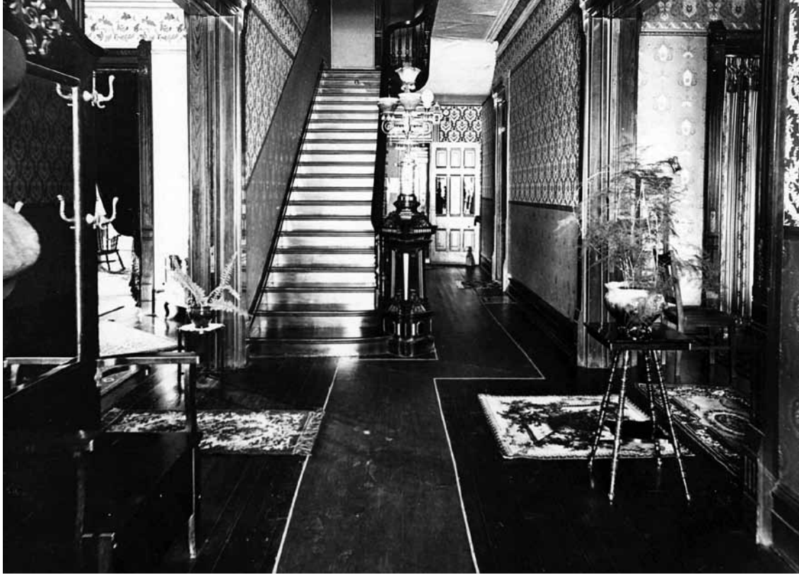
The Houses, White recalled in his Autobiography, “were Jewish people, and to them a wedding was a great ceremonial.” To finish his “evening chores” at the paper, White skipped the ceremony at the House home and attended only the “gorgeous dinner and dance” at the Odd Fellows Hall after the nuptials. “We heard three days ahead about that dinner from the grocery boys and their hired girl friends,” White wrote, “and from the expressman who was bringing delicacies from Kansas City to the home; a crate of lobsters, for instance, and venison and molded ice cream—a new confection in the eighties—and a wedding cake four feet high.” Had he attended the wedding, White would have entered the House home through its grand hallway, pictured here courtesy of the Watkins Museum, Lawrence, Kansas.