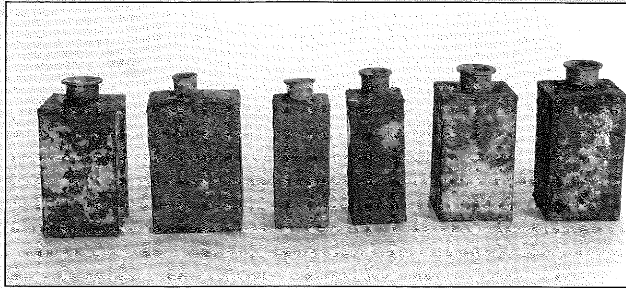
Medicinal tins recovered at Fort Hays.