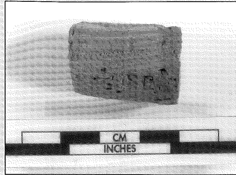
Cork showing stamped lettering. Some of the tins still retain their cork stoppers.

stimulant, and diuretic; "Extract of Valerian," a perennial herb used as a sedative and gas reliever; and Creosote, distilled wood tar with antiseptic properties. One can wonder if any of these were contained within the Fort Hays tins. The methods and remedies that the early doctors and medical stewards employed would cause today's patients to shudder. One can speculate about what future patients will think about the medicines and treatments used in the year 2005.