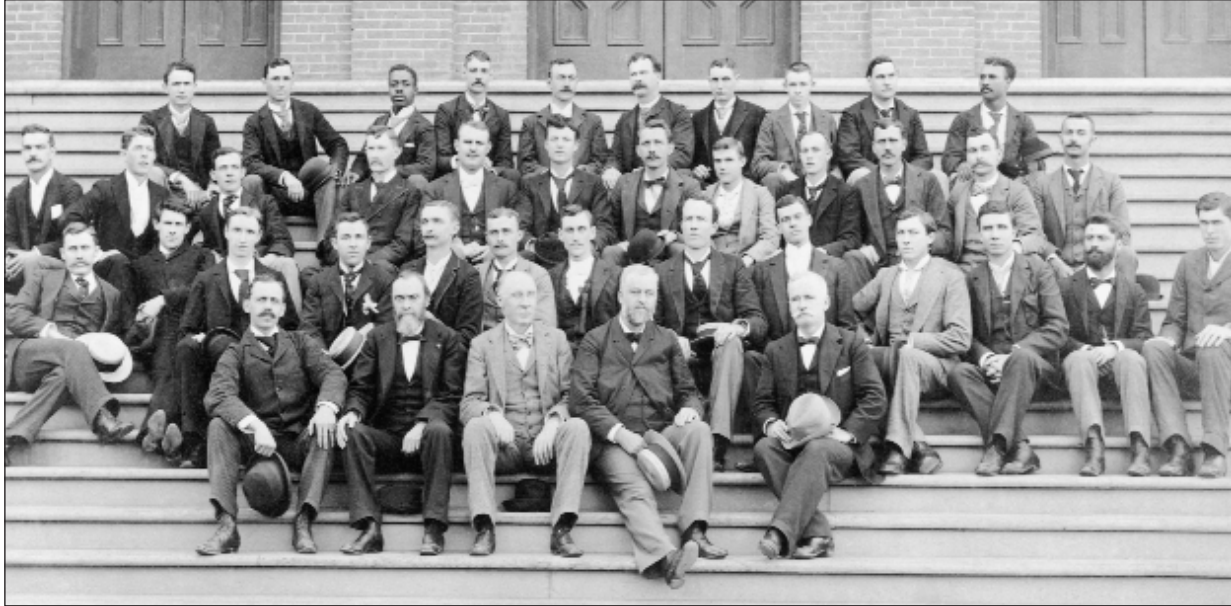
At the end of the nineteenth century some law schools were closed to blacks, and African Americans wanting a legal education turned to Kansas, where they were welcome. Two black students (top row) appear in this photo of an 1890s law school class at the University of Kansas.