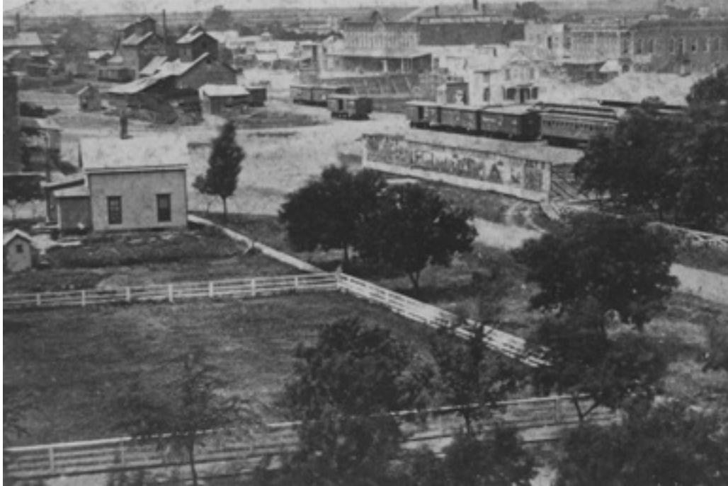
Abilene's reputation as a lawless cow town in the 1860s gave way by the 1880s and 1890s. Rather than having an identity based on saloons and brothels, the Abilene of Eisenhower's childhood was populated by shopkeepers and wheat farmers, models of manly self-discipline.

This article will examine the dutiful manhood that proliferated in nineteenth-century rural towns such as Abilene and how, despite the new emphasis placed on masculine power in the cities, rural areas largely rejected the urban paradigm and maintained a traditional emphasis on manly virtue. Abilene in the late 1890s provides a miniature example of the persistence of this model of manhood, and Eisenhower's upbringing demonstrates how one generation passed this gender conception onto the next. Differentiating understandings of maleness at the turn of the century is critical for understanding the gender transition of the 1890s and the competing constructions of maleness in the twentieth century. Understanding male identity in Abilene gives us a better understanding of gender relations across nineteenth-century Kansas and their reverberations throughout the nation in the succeeding century. 2