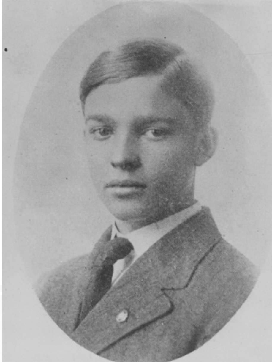
Dwight David Eisenhower as a senior at Abilene High School, 1909.