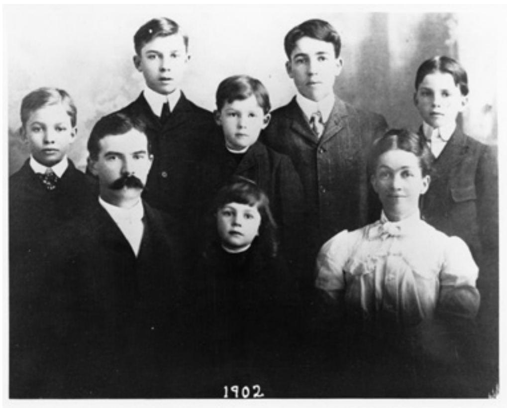
Dwight Eisenhower credited his parents with instilling in him and his brothers a sense of manly self-discipline, which shaped their future actions. This family photograph from 1902 captured the idyllic image of Eisenhower's moral background.

roles explained the absence of quarreling and peace in the home. "Father was the breadwinner, Supreme Court, and Lord High Executioner. Mother was tutor and manager of our household. Their partnership was ideal." 31