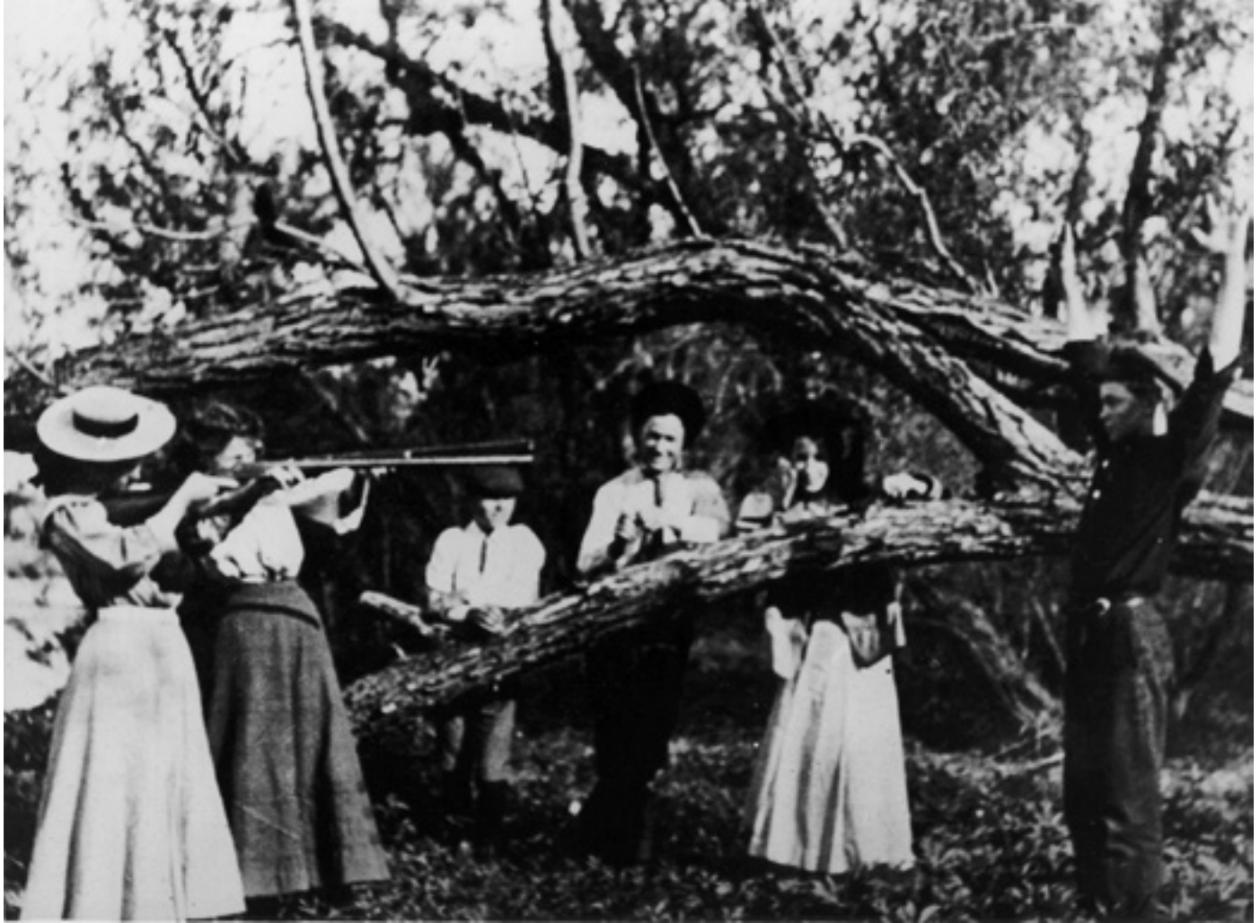
Future promoters of Eisenhower's political career tried to capitalize on the nostalgia of Eisenhower's upbringing, but Dwight believed that most American children had similar experiences. Eisenhower (far right) and his friends are pictured here in 1907 at Brown's Park.

tion still remained between towns and cities at the end of the century to distinguish competing notions of manliness. Neither did all rural small town families match the Eisenhowers according to economic position. Dutiful manhood crossed class, religious, and regional demarcations, though less evenly between urban and non-urban spaces.