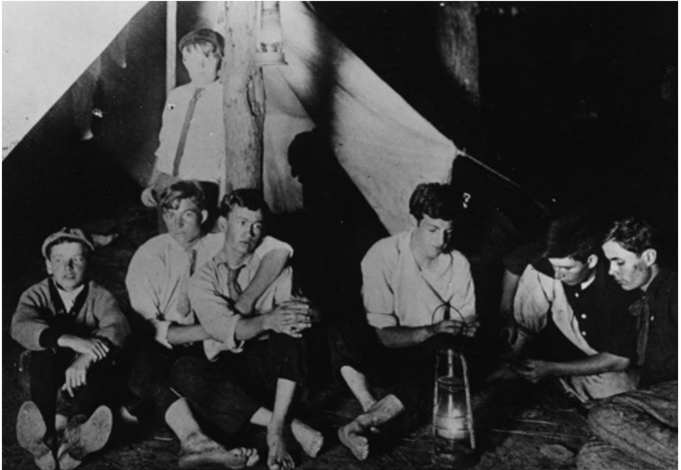
Dwight Eisenhower and his brothers remembered hard work during their childhood, but they also enjoyed participating in outdoor activities such as camping and hunting.