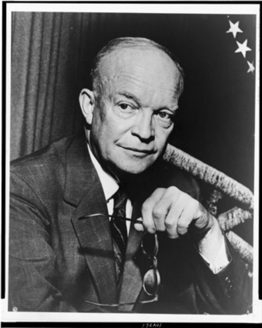
Despite the new emphasis on masculine power in the cities at the turn of the twentieth century, Eisenhower embraced the more traditional dutiful manhood of the nineteenth century throughout his military and political careers.

Dutiful manhood itself quickly fell into disfavor amidst the turbulence of the early twentieth century. The urban veneration of hard-bodied masculinity mocked the prudishness of rural males and would eventually win the argument in the roaring twenties. Yet dutiful manhood would reappear in “the greatest generation” as the impetus to survive the Depression, storm Normandy’s beaches, and settle the suburbs after the war. Threatened with nuclear annihilation, racial upheaval, working women, and challenges to American supremacy abroad, the nation’s males looked back to rural simplicity