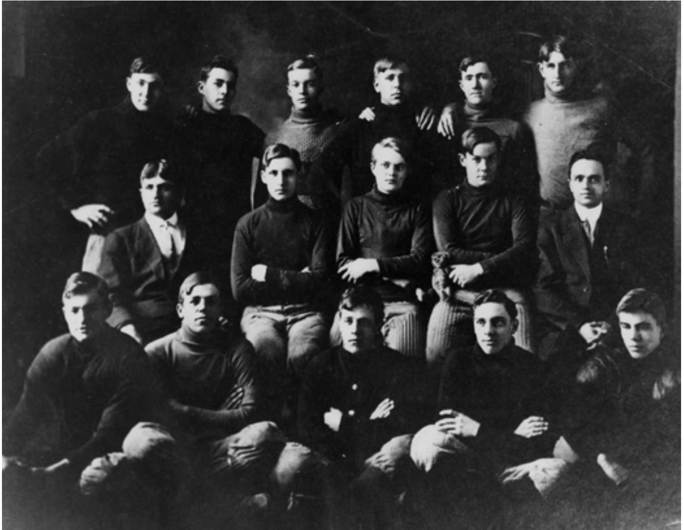
Eisenhower and his brothers embraced sports including baseball and football as a means of learning manly self-discipline. Eisenhower is in the back row, third from the left in this 1910 photograph of his high school football team.

While urban areas increasingly employed sports to demonstrate masculine prowess, Dwight conceived of athletics as an arena to sharpen manly character. Athletics were the primary passion of Dwight during his high school years. He played baseball and football at Abilene High School. He was proud of his school's undefeated football season his junior year. When the Abilene High baseball team played the University of Kansas freshman team in 1908, Dwight misjudged a fly ball and allowed it to go over his head. His team ended up losing, seven to three, and later he said that he carried the regret over the error for a long time. He helped organize the Abilene