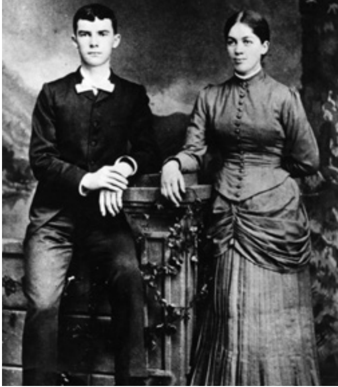
David and Ida Eisenhower married in 1885 and had six sons who lived to adulthood. Eisenhower remembered his parents having a perfect partnership based on nineteenth-century gender roles in which his mother cared for the home and family and his father was the breadwinner.

new consumerism, promiscuity, and violence. Sport and boxing promoters were able to capitalize on the expendable hours that urban workers enjoyed while rural workers completed additional chores. Whereas systematization and publication of baseball, football, and boxing matches could thrive in multiple urban media outlets, rural towns usually only supported a single newspaper devoted to local business. The smaller size of rural towns accommodated a community of accountability whereas larger population areas struggled to mandate virtue and self-restraint. It was easier for churches and evangelical Christianity to hold sway over the smaller and more homogenous populations of rural towns than the larger ethnically and religiously diverse populace of the city.